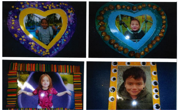
Photo of the lovely gifts given from the children to their grandparents/Special Persons Day

Thank-you to everyone that turned up to our Junior Division Grandparents/Special persons day. It was great to see so many families come along and cheer along the students during the Rippa rugby tournament. We had Kereru in Second place and Kaarearea in first place, Congratulations! And well done to everyone that participated, I could see a lot of resilience and co-operation throughout the day! Junior Division